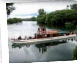
The Riverboat Waireka