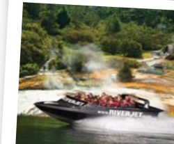
NZ RiverJet at Orakei Korako