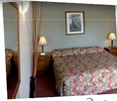
Spacious accommodation available