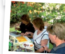
Everyone is an artist at The River Lodge!