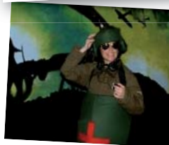
MASH Theme Night