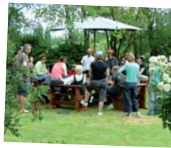
A group enjoys some drinks outside

ONLY $60 pp, any group size welcome - bookings essential - 07 333 8165